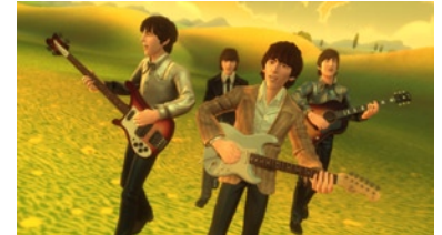
©2009, The Beatles: Rock Band .

3ds Max, well known for its extensive polygon modeling and texturing toolset helps you to get the job done faster. The Graphite toolset incorporates 3D modeling tools for freeform sculpting, texture painting, and advanced polygonal modeling—unified in a highly efficient user interface. Moreover, extensive UVW mapping tools help facilitate a wide range of operations for creative texture, planar, and pelt mapping, and enable direct manipulation of texture mapping coordinates.