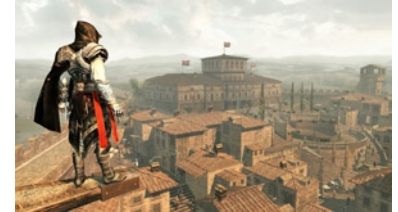
Assassin's Creed II .

Incorporating a wide array of tools that help accelerate everyday workflows, Autodesk® 3ds Max® software helps significantly increase productivity for both individuals and collaborating teams working on games, visual effects, and television productions. 3ds Max provides a comprehensive solution for modeling, animation, rendering, and effects, together with the powerful 3ds Max Composite high dynamic range (HDR) compositing system. Artists can focus on creativity, and have greater freedom to iteratively refine their work to help maximize the quality of their final output in the least amount of time.