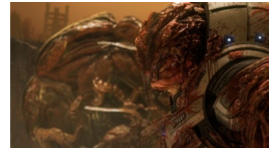
Mass Effect 2.

1 A Powerful Companion to Maya An ideal companion to Autodesk® Maya® software, Autodesk® Softimage® software is a high-performance, comprehensive 3D application that enables artists to use intuitive, nondestructive workflows to help create sophisticated character animation and effects. Featuring a unique, multi-threaded Softimage GigaCore architecture, and innovative tools: Interactive Creative Environment (ICE) and Softimage® Face Robot® toolset, Softimage helps extend a Maya pipeline with the ability to more quickly and easily create massively detailed simulated effects, advanced character rigs, and lip-synced facial setups.