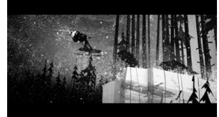
Studio AKA, image courtesy of BBC Winter Olympics.

Increased competition and tighter deadlines, combined with higher audience expectations for quality, mean that many jobs require artists to produce more creative content in less time than ever before. Softimage helps maximize productivity through advanced creative tools, efficient scene management tools, nondestructive workflows, and support for collaborative workflows. Repetitive tasks can also be automated through Python® scripting language. As a result, Softimage is one of the entertainment industry's leading 3D production tools. It has been used extensively by award-winning film, game development, and broadcast production facilities.